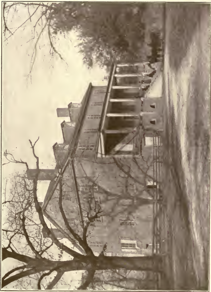
MULBERRY HOUSE, NEAR CAMDEN, S. C.